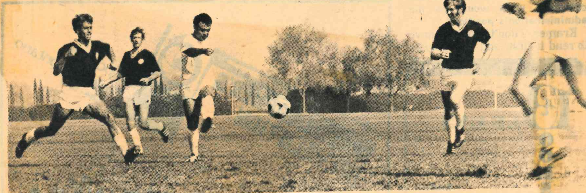
CAL POLY'S SOCCER team moves the ball around against Westmont College. The Broncos fell to Westmont when the northerners came from a 1-0

deficit in the first quarter to win 4-1. The Broncos face San Diego State Saturday at 11 a.m.