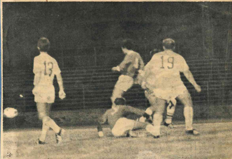
POLY SOCCER Team moves against Claremont.